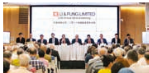
Our annual general meeting.