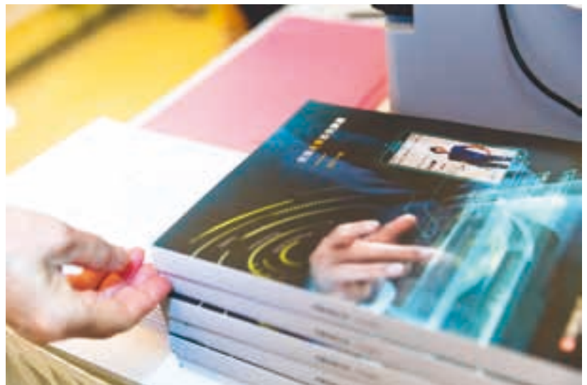
Effective engagement with investors and timely disclosure are key components of good corporate governance.

To facilitate equal access to information, we have made constitutional documents, financial reports, announcements and circulars readily available on both the website of the Stock Exchange and our corporate website. Furthermore, presentation materials as well as comprehensive information on our company's business model and strategy can be found on our corporate website. Lastly, investors can also elect to receive information by email.